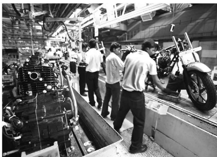
In September 2020, sales of 125cc models — that include the Hero Glamour, Splendor, Pulsar 125, Victor Star City, among others — grew by a whopping 30 per cent over the same period a year ago to 305,615 units